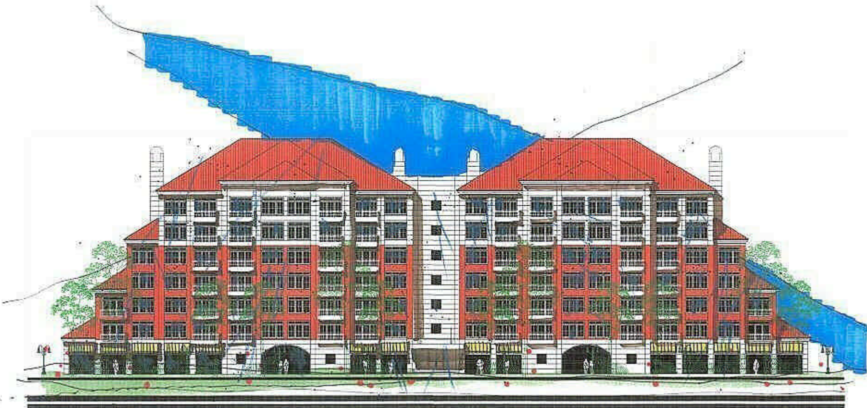
Concept Elevation /Route 73